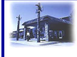
Coast International Inn

AWRC's 2nd Annual Domestic Violence Conference